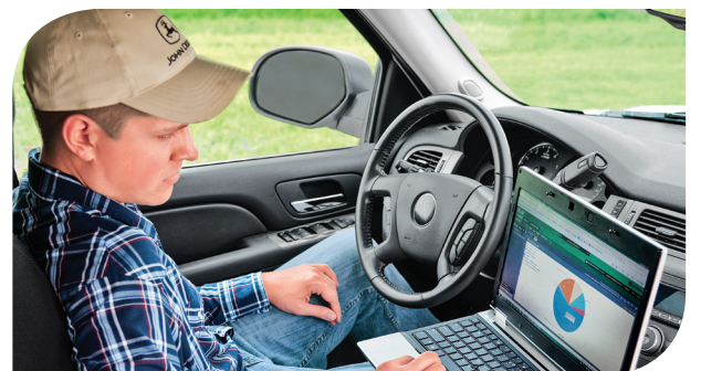
Example of Service Advisor Remote

Never too early to prepare for next season. As you pull your planter or seeder out of that last field and head home for the year, don't forget to stop by your local Grossenburg dealer and have your equipment inspected. Inspecting now not only saves time next spring, but you won't have to try and remember that question you had from last year. Annual inspections are an integral part of every producer's operation as they are the first line of defense against major repairs and untimely breakdowns during the season. While you're here don't forget to talk to your service manager so you can take advantage of current programs and financing options to suit your operation.