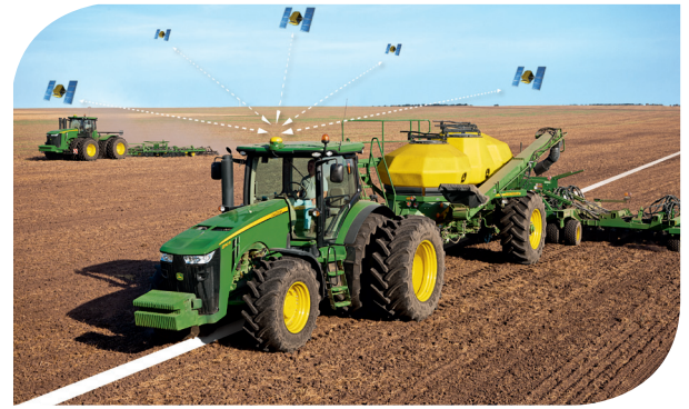
Example of JDLink in action